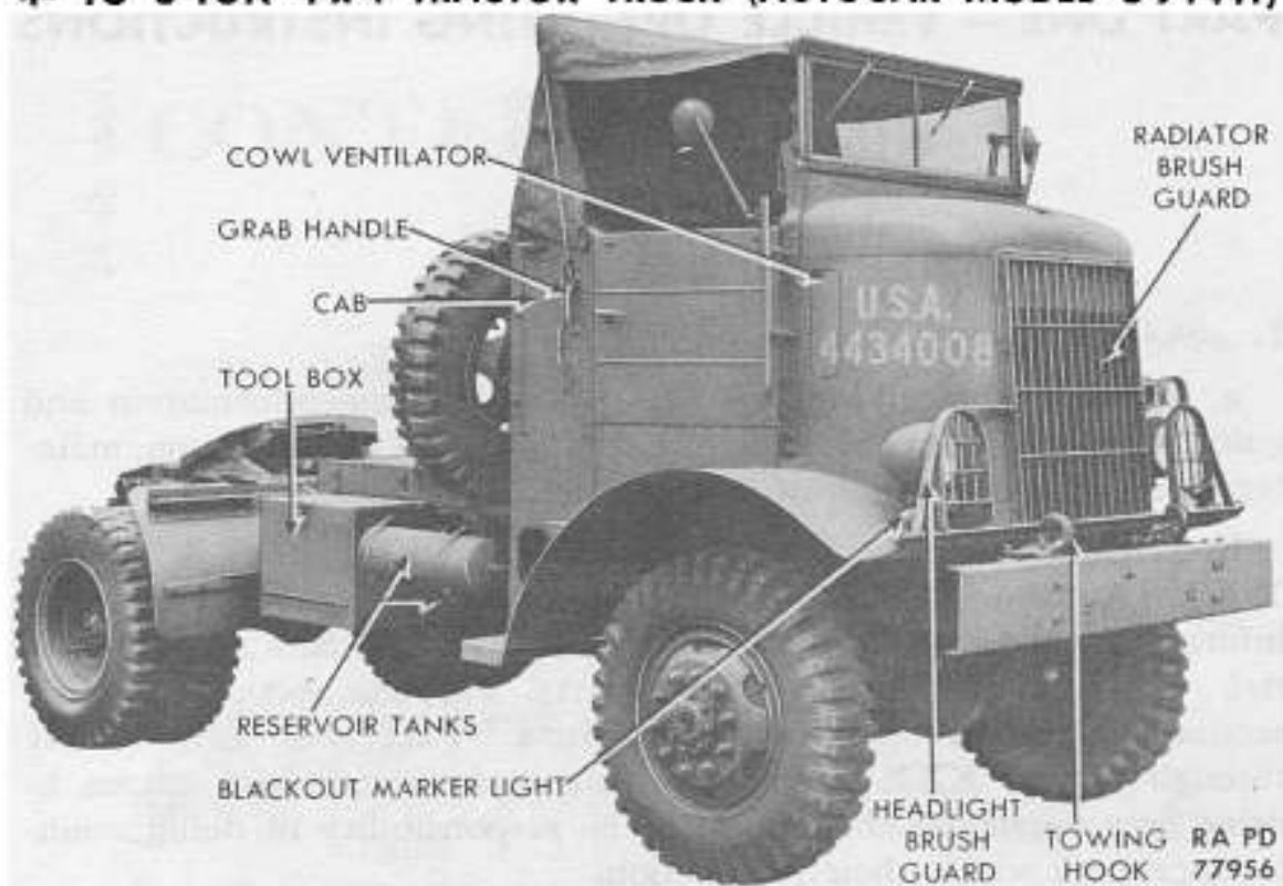
Figure 1 — Truck — Right Front