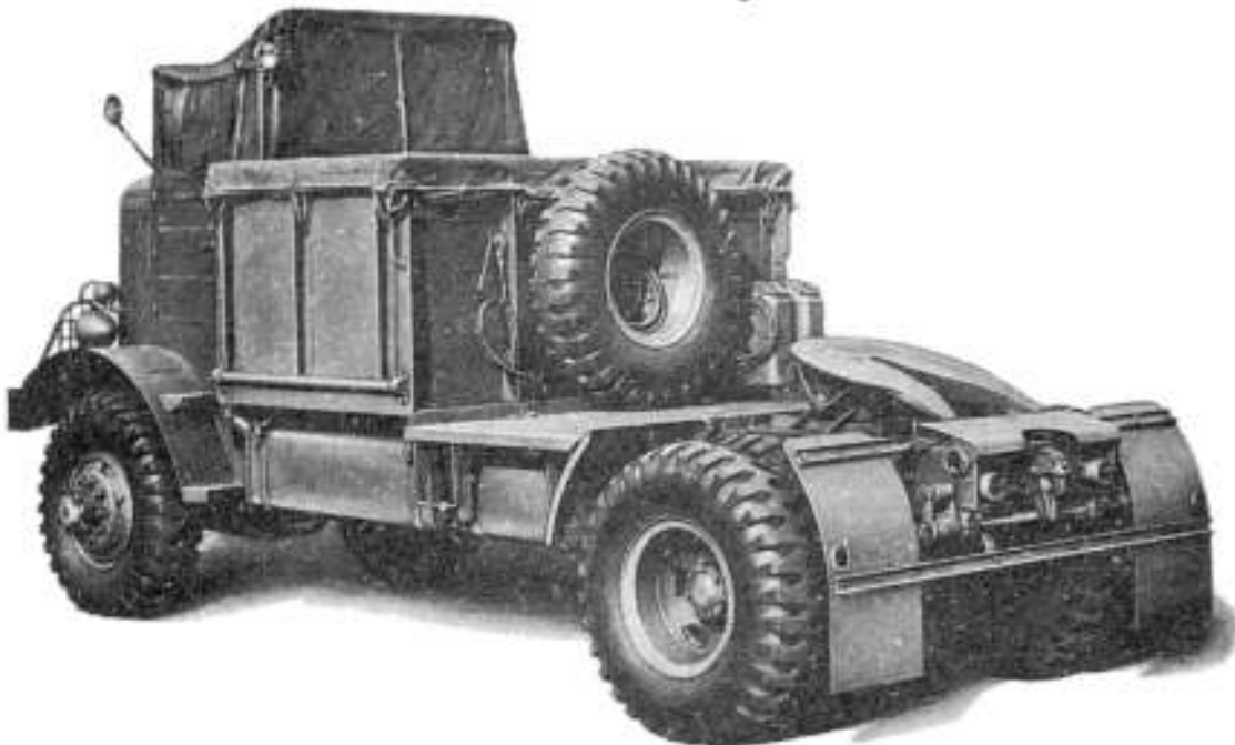
Figure 2 — 5- to 6-ton, 4 x 4, Ponton, Tractor Truck (Open Cab) — Front Side View — Right Side