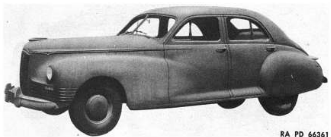
Figure 9 — Car, 5-Passenger, Medium Sedan (Packard)