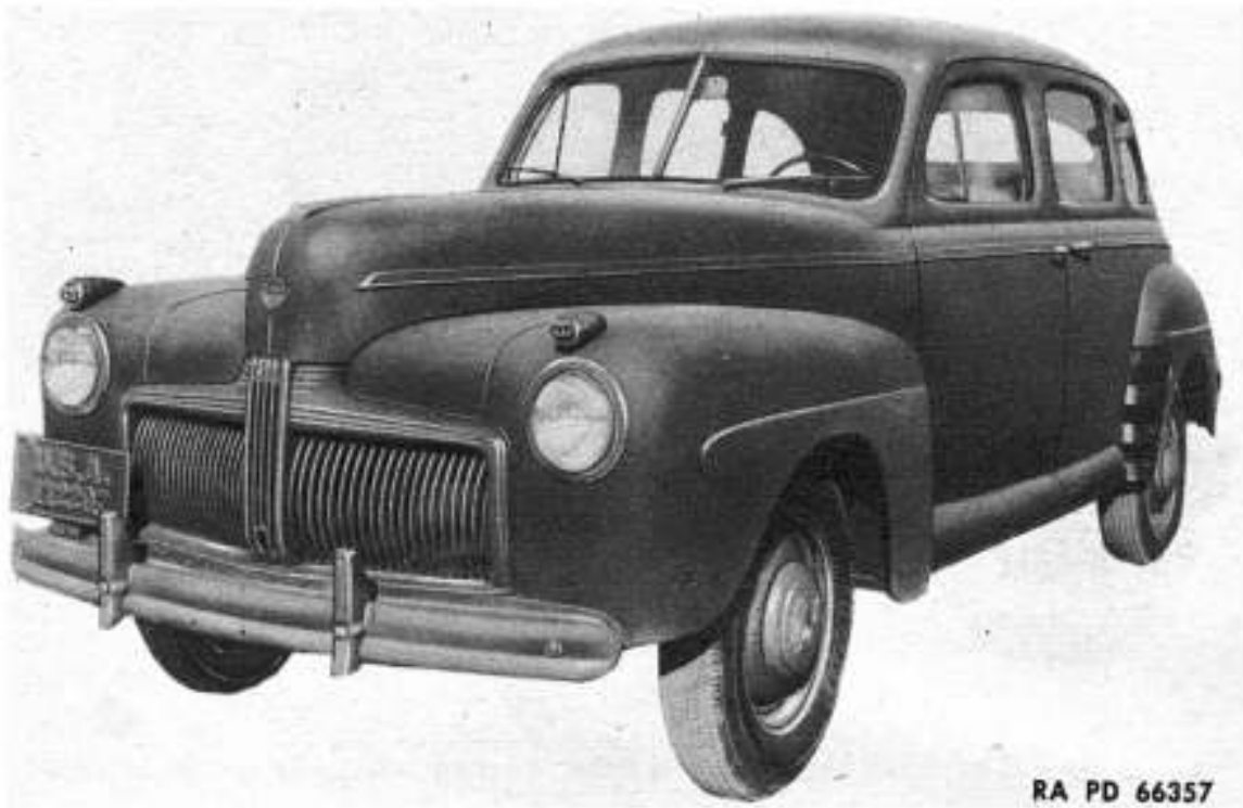
Figure 6 – Car, 5-Passenger, Light Sedan (Ford)