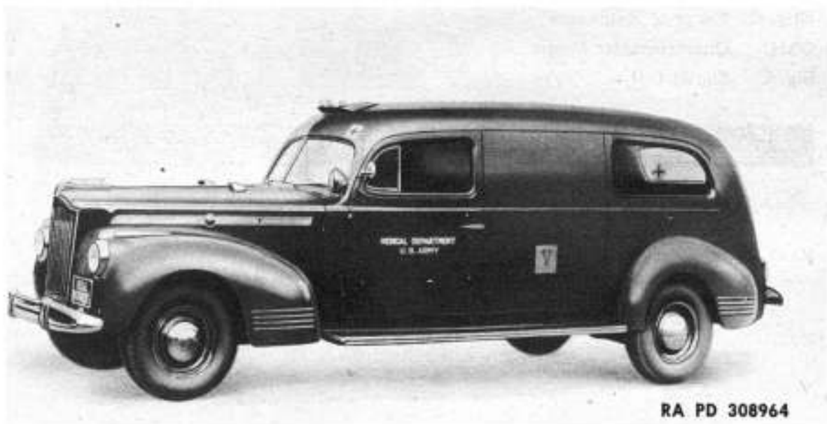
Figure 2 — Ambulance, 3/4-ton, 4 x 2 (Packard)