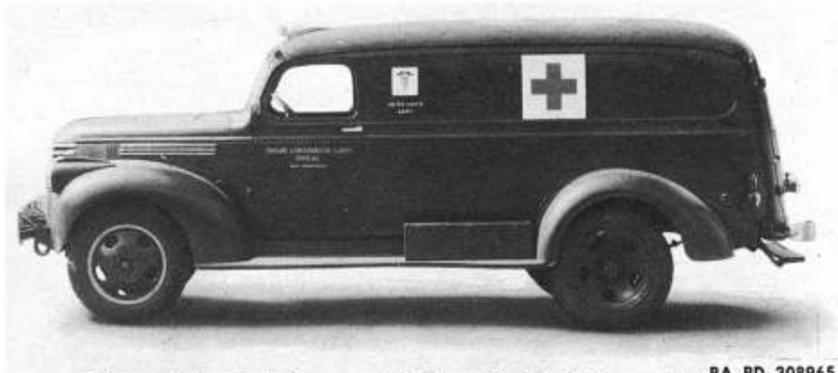
Figure 4 — Ambulance, 1 1/2-ton, 4 x 2 (Chevrolet) RA PD 308965