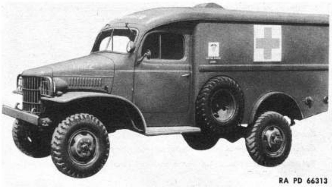
Figure 1 — Ambulance, 1/2-ton, 4 x 4 (Dodge)