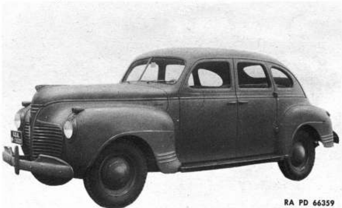
Figure 7 – Car, 5-Passenger, Sedan (Plymouth)