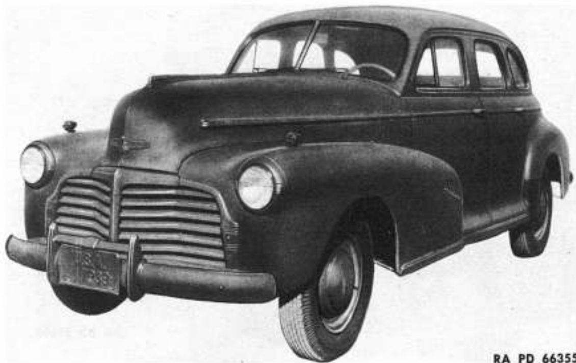
Figure 8 — Car, 5-Passenger, Light Sedan, 4-Door (Chevrolet)