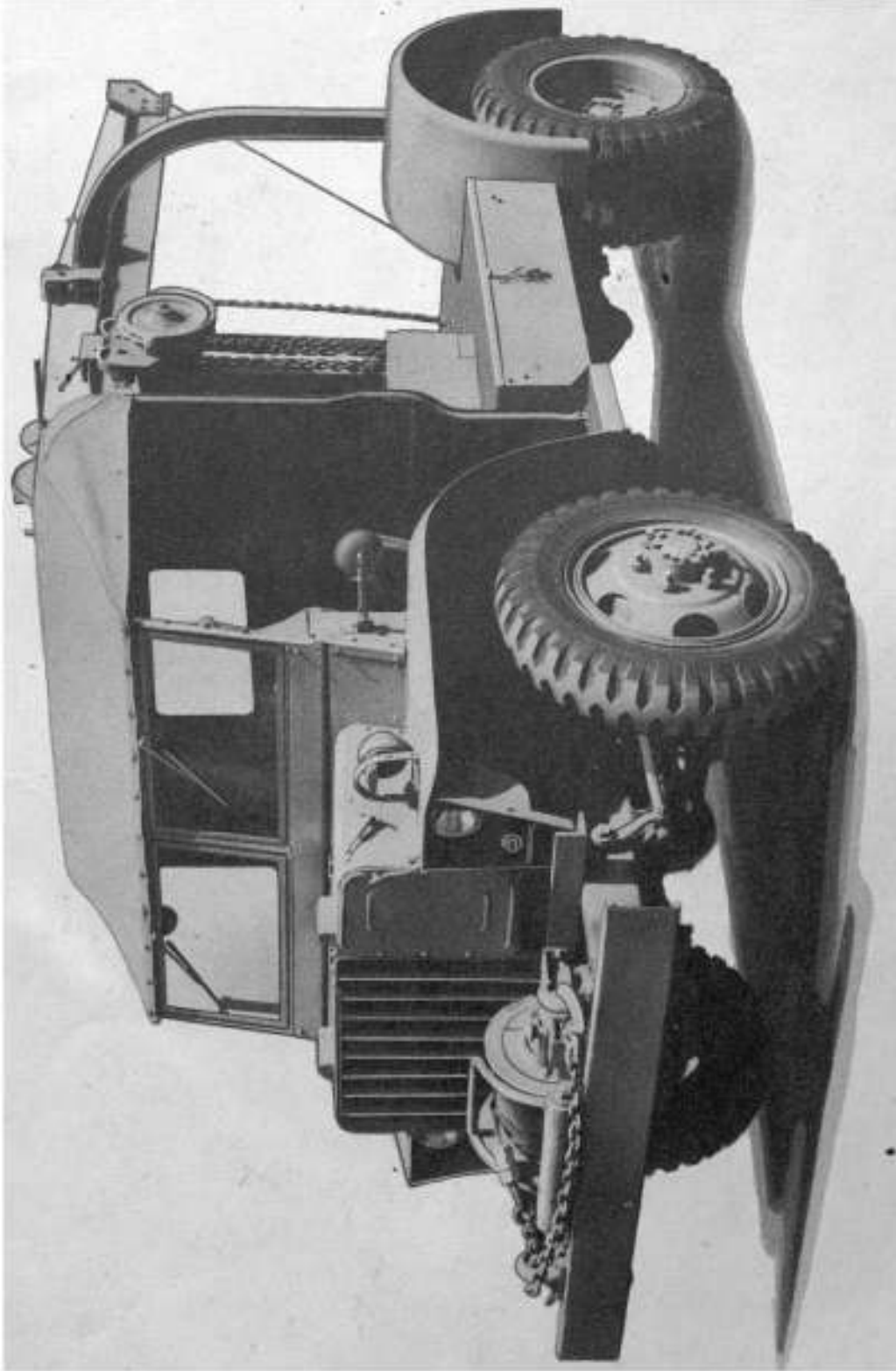
Ford Model GTBC - "Mark II Mod. 2" 4x4 Bomb Service Truck - 115" Wheel Base, 6 Cylinder Engine. Registration Numbers - U.S.N. 101000 to U.S.N. 108199 in- clusive