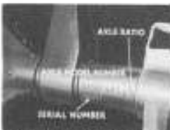
REAR AXLE —Stamped on axle housing tube (short side).