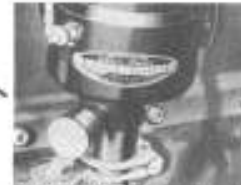
DISTRIBUTOR —Model number plate on body of distributor.