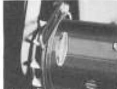
GENERATOR —Model number on plate at pulley end of generator.