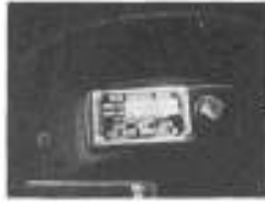
WINCH —Number plate located at filler plug.

Specify Chassis Serial Number and Engine Serial Number in all references to vehicles covered by this publication. Specify Model or Serial Number of units of vehicle whenever service on these items is required.