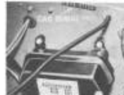
CAR & VOLTAGE REGULATOR —Car serial number plate on L. H. of oval under hood. Regulator model number plate appears on cover of regulator.