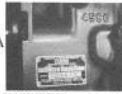
TRANSMISSION —Model number appears on name plate on L. H. side of transmission case.