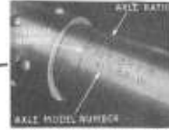
FRONT AXLE —Stamped on R. H. side of housing.