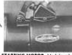
STARTING MOTOR —Model number plate on side of motor.