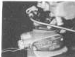
GOVERNOR —Model number stamped on governor name plate.