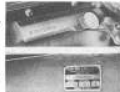
ENGINE —Serial number plate on L. H. of crankcase—also stamped on R. H. side of crankcase near distributor.