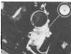
CARBURETOR —Model number stamped on disc near cleanout plug.