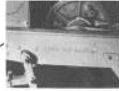
CHASSIS SERIAL NO. —Stamped on R. H. frame side rail above front spring.