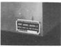
CARGO BODY —Model number plate on lower L. H. fast corner of body.