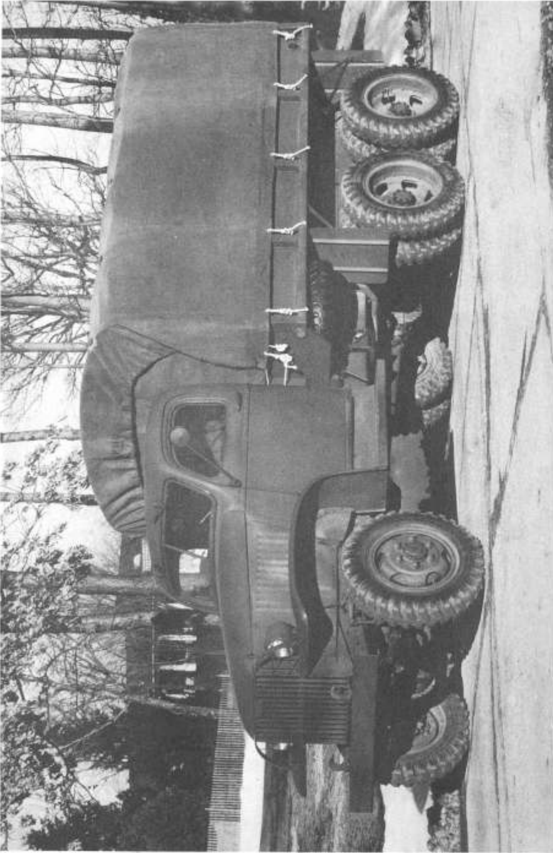
GMC TRUCK 2½-TON 6x6 TRUCK (Model illustrated is 164" wheelbase—is not equipped with winch)