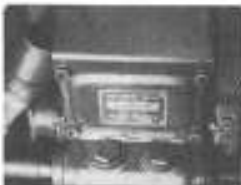
POWER TAKE-OFF —Serial number plate on L. H. side of housing.