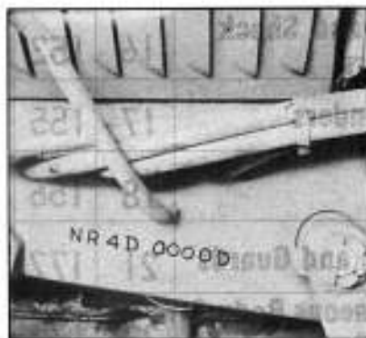
Chassis Serial Number stamped on front end of left frame side member

It is important to specify chassis serial number of vehicle when servicing same. Engine serial number should also be given. This is especially important when ordering parts. The illustrations below will assist in locating the serial numbers.