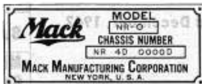
Chassis Name Plate located on right hand seat support