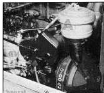
Engine Serial Number stamped on right side of timing gear housing