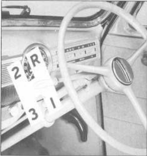
Fig. 2—Transmission Gearshifting Diagram