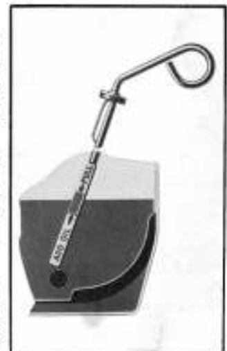
Fig. 1—Oil Gauge Rod

Check the oil level frequently and add oil when necessary. Always be sure the crankcase is full before starting on a long drive.